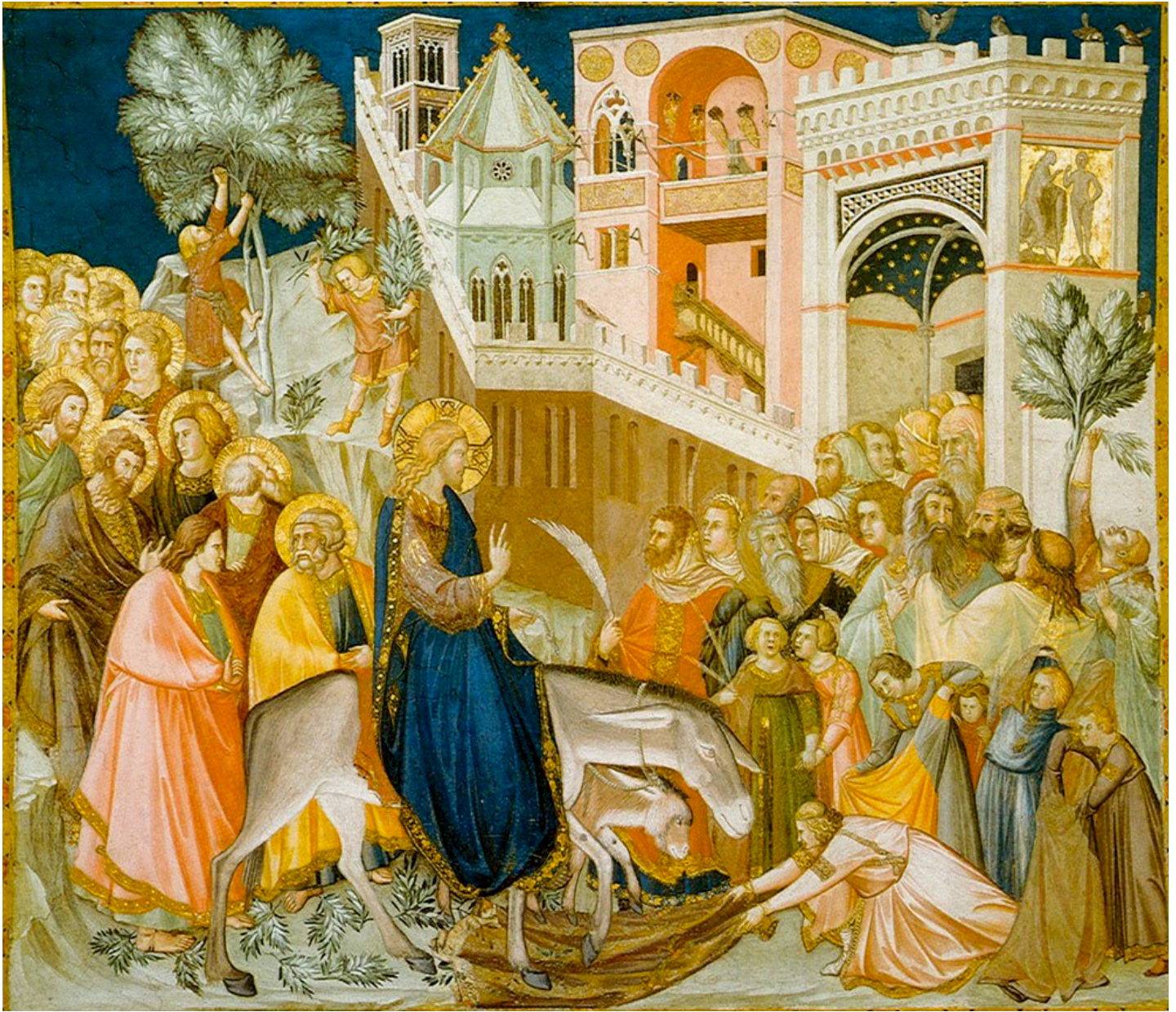
The Entry into Jerusalem Artist: Pietro Lorenzetti Location: Basilica of Saint Francis of Assisi, Assisi, Italy 14th Century